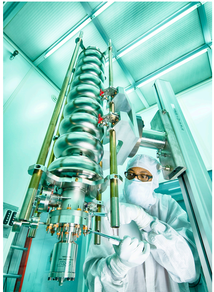
Cooled to minus 456 degrees Fahrenheit, these niobium cavities allow radiofrequency fields to boost electron energies without electrical resistance. Cryomodules—consisting of eight niobium cavities each—are a key component of LCLS-II's superconducting linear accelerator.

At the beam switchyard, electron beams from each linac will be directed to one of two new undulators to produce hard or soft X-ray laser pulses. The pulses then travel to experimental halls where scientists conduct research.